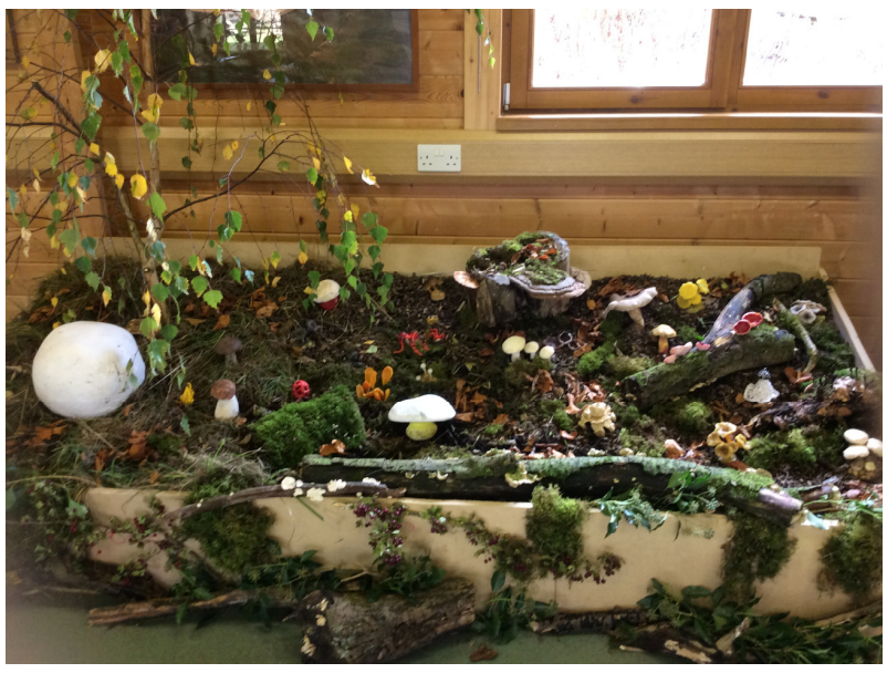
Steve's woodland stand.

Meanwhile we set out the specimen display on moss and woodchip covered