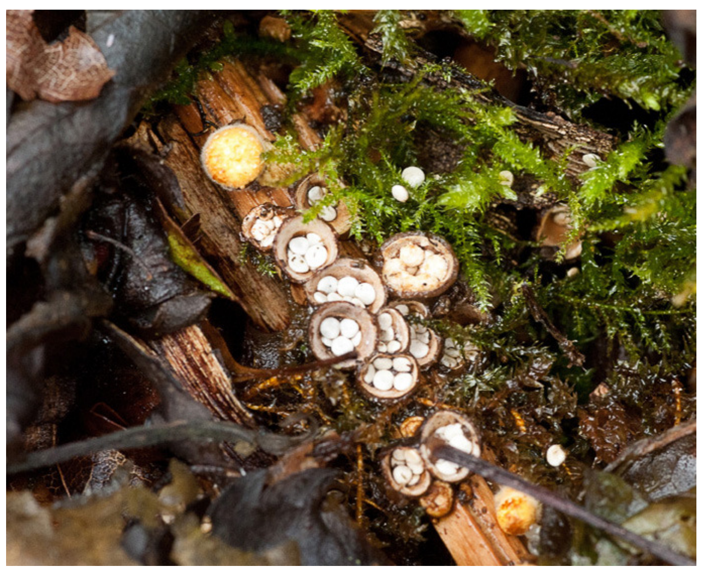
Crucibulum laeve (Common bird's nest) which delighted our walkers on both forays. The fruitbodies seen here at either end still have their yellow protective covering in tact – this ruptures at maturity to reveal the 'nests' with tiny sacks full of spores which are dispersed by rain droplets. (photo NW)

We felt the weekend was a great success and had been enjoyed by everyone – whether helpers or punters. Our message of spreading the word about the importance of the fungus Kingdom was well received by young and old alike, whatever their level of interest, and we went away tired but satisfied with a good and worthwhile job done.